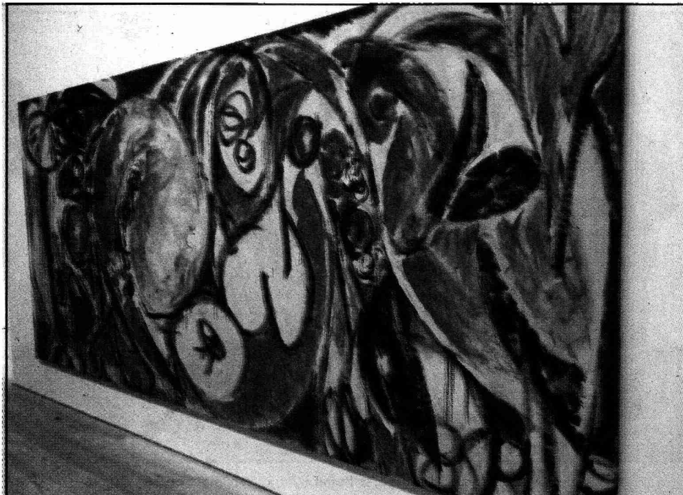
Lee Krasner's "The Seasons" (1957) will be on display at Katonah Art Museum on Oct 6.